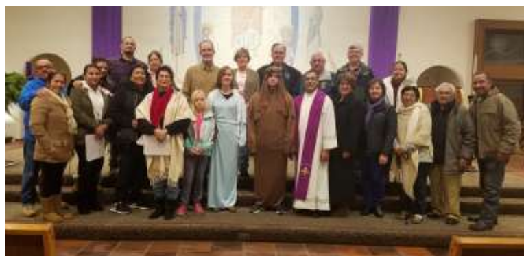
← The participants in the Las Posadas celebration December 4.